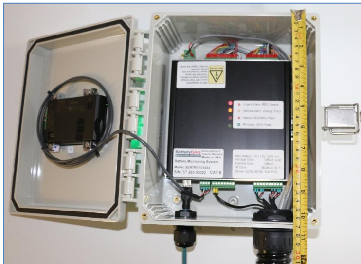
NEMA Enclosure Option

Validated with: VRLAB (Valve Regulated Lead Acid Batteries) Wet/Flooded Lead Acid Batteries Ni-Cad Batteries