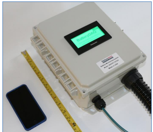
HMI Display Panel Option

7309 York Road Towson, MD 21204 United States